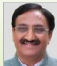
Shri Ramesh Pokhriyal 'Nishank' Minister of Human Resource Development

& all the Chief Ministers of the State & Union Territory of India