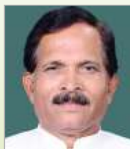
Shri Shripad Yesso Naik Union Minister of State (IC), Ministry of AYUSH