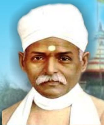
Bharat Ratna Mahamana Pandit Madan Mohan Malaviya