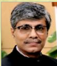
Padmashree Vaidya Rajesh Kotecha Special Ssecretary, Ministry of AYUSH Government of India