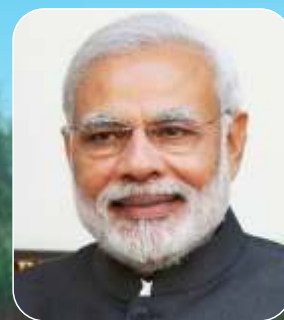
Shri Narendra Damodardas Modi Hon'ble Prime Minister of India