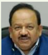
Dr. Harsh Vardhan Union Minister for Health & Family Welfare, Science & Technology and Earth Sciences

Presented to: Shri Narendra Damodardas Modi, Hon'ble Prime Minister of India