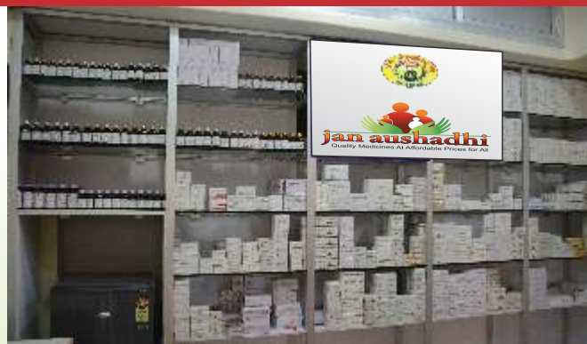
Inside Jan Aushadhi Store at Mata Anandamayee Hospital