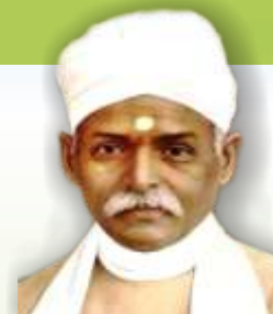
'Mahamana' Pandit Madan Mohan Malaviya