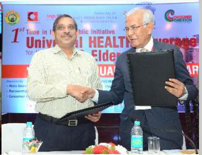
▲ Signing of MOU between IIT-BHU & PSM India