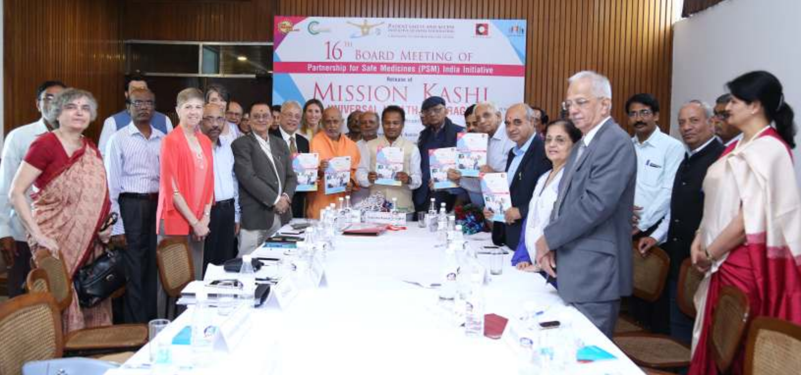
Shri Ravindra Kumar Jena (BJD) Member of the Parliament Lok Sabha, Orissa releasing the Report of PSM India 15 Board Meetings