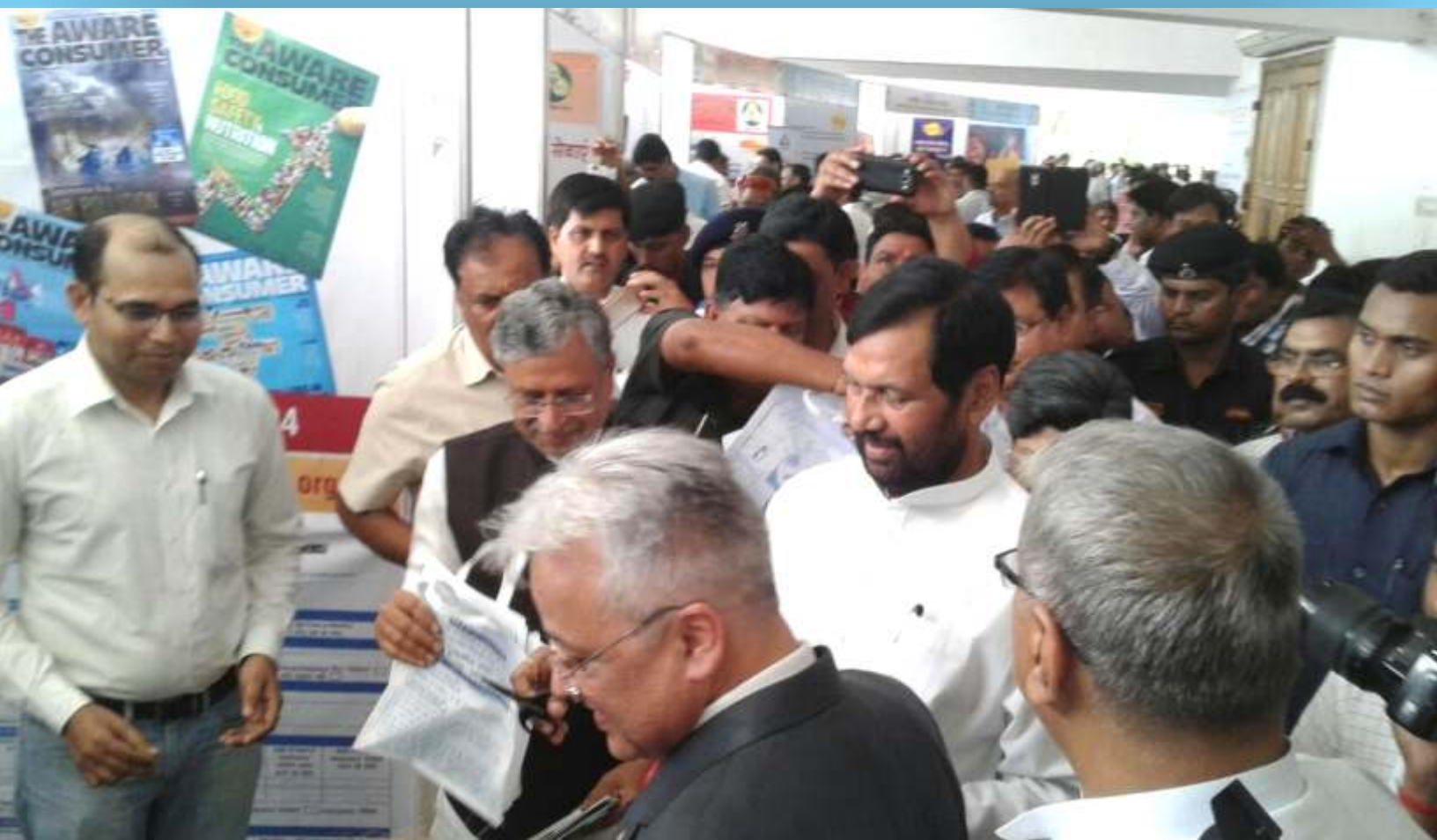
Hon'ble Union Cabinet Minister Shri Ram Vilas Paswan alongwith Shri Sushil Kumar Modi, Former Dy. Chief Minister of Bihar inaugurating the PSM Stall at Patna Consumer Mela.