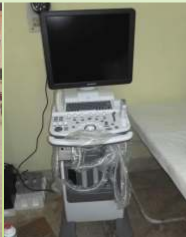
Water Purifier, Ambulances and Ultrasound machine donated by citizen