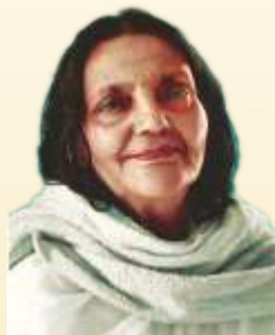
Sri Anandamayee Ma