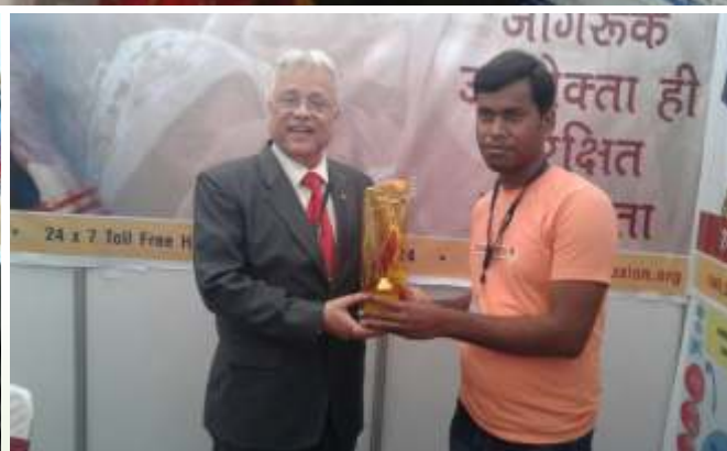
Winners of the Slogan Contest at the Patna Consumer Mela

faculty has also agreed to cover issues concerning Patient Safety and strengthen the Pharmacovigilance Program of India (PvPi) and Rational Use of Antibiotics/medicines to record regularly incidents of Adverse Drug Reactions (ADRs) and anti-resistance antibiotics. MAH was also declared as an ADR Centre under the PvPI initiative by India Pharmacopeia Commission, Ministry of Health and Family Welfare, Government of India. We also facilitated in launching Haemovigilance Programme of India (HvPI) to identify and prevent occurrence and recurrence of transfusion related unwanted events, to increase the safety, efficacy and efficiency of Blood Transfusion, covering all activities of the transfusion chain from Donor to Recipient. The Department of Pharmaceutics within