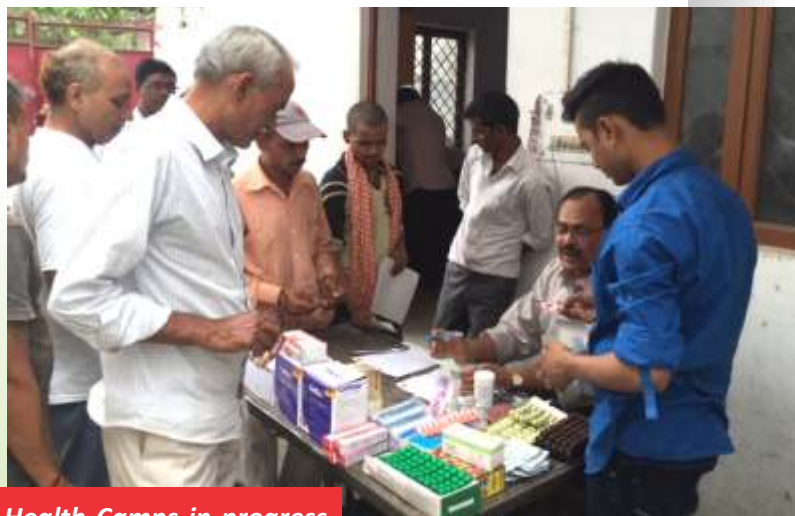
Health Camps in progress