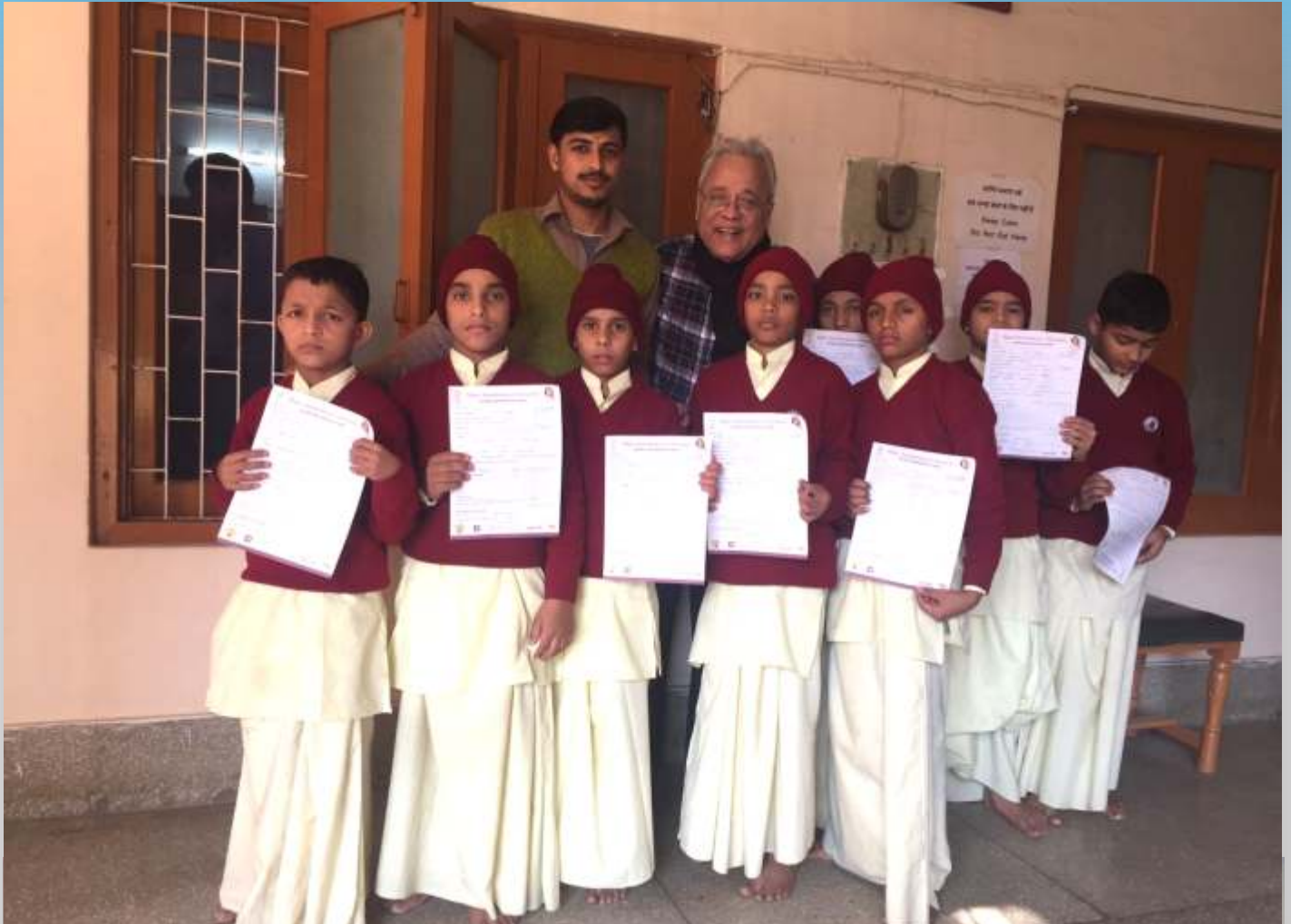
Students of Shree Shree Ma Anandamayee Vidyapeeth, Kankhal, Haridwar displaying their Health Card Report