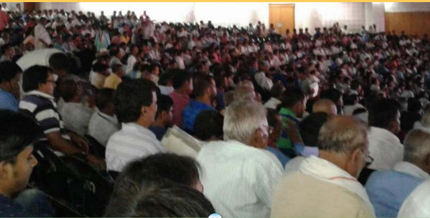
The view of the participants at the Patna Consumer Mela