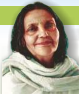
Shree Shree Ma Anandamayee