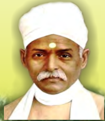
Bharat Ratna Mahamana Pandit Madan Mohan Malaviya

From Monday 27 th April to Saturday 2 nd May 2020 from 11 AM (IST)